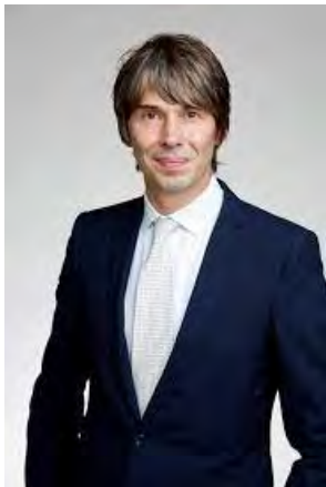
Professor Brian Cox

On June 15th 2021, schools across the country will be taking part in the Great Science Share. Professor Brian Cox is opening the virtual event and children at New York have been submitting their questions for the scientist. What would you ask Professor Brian Cox if you had the chance? Email your suggestions to your class teacher!